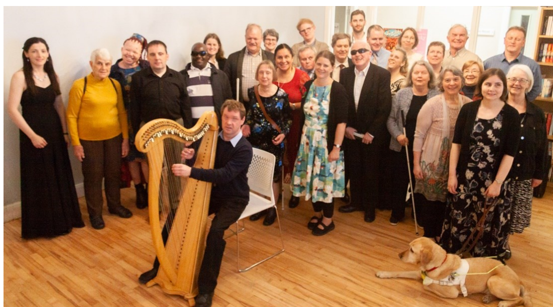
Attendees at the 2018 ICEB mid-term executive meeting in Ireland

Thanks are extended to Braille Literacy Canada for hosting the meeting in collaboration with ICEB. We look forward to connecting with you all in a week dedicated to braille.