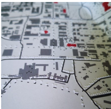
Tactile and clear print map created using TMAP

https://www.macfound.org/fellows/class-of-2021/joshua-miele