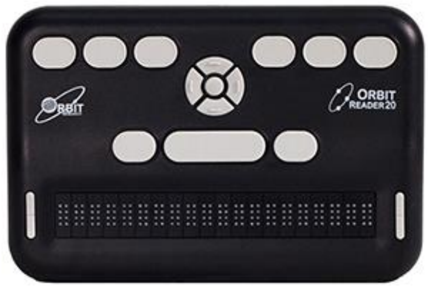
1The Orbit Reader 20

In the first two months of sales, RNIB has sold 170 units. According to Claire Maxwell, Senior Product Developer — Braille, most people are purchasing the Orbit Reader 20 to access content on other devices. She said, "This is due in the main to the limited number of digital braille books available. RNIB has provided details of free and paid-for translation packages to enable customers to create their own electronic braille files, but many customers still prefer to access books in mainstream apps, and read them in braille on the Orbit Reader 20." She added, "At present RNIB are working on a project to offer our current library books as downloads. This will happen in 2019."