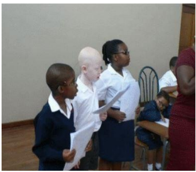
Students participating in World Read Aloud Day in 2018

Blind SA, a prominent consumer organisation of Blind persons, and the South African Braille Authority (SABA) have joined Nal'ibali again